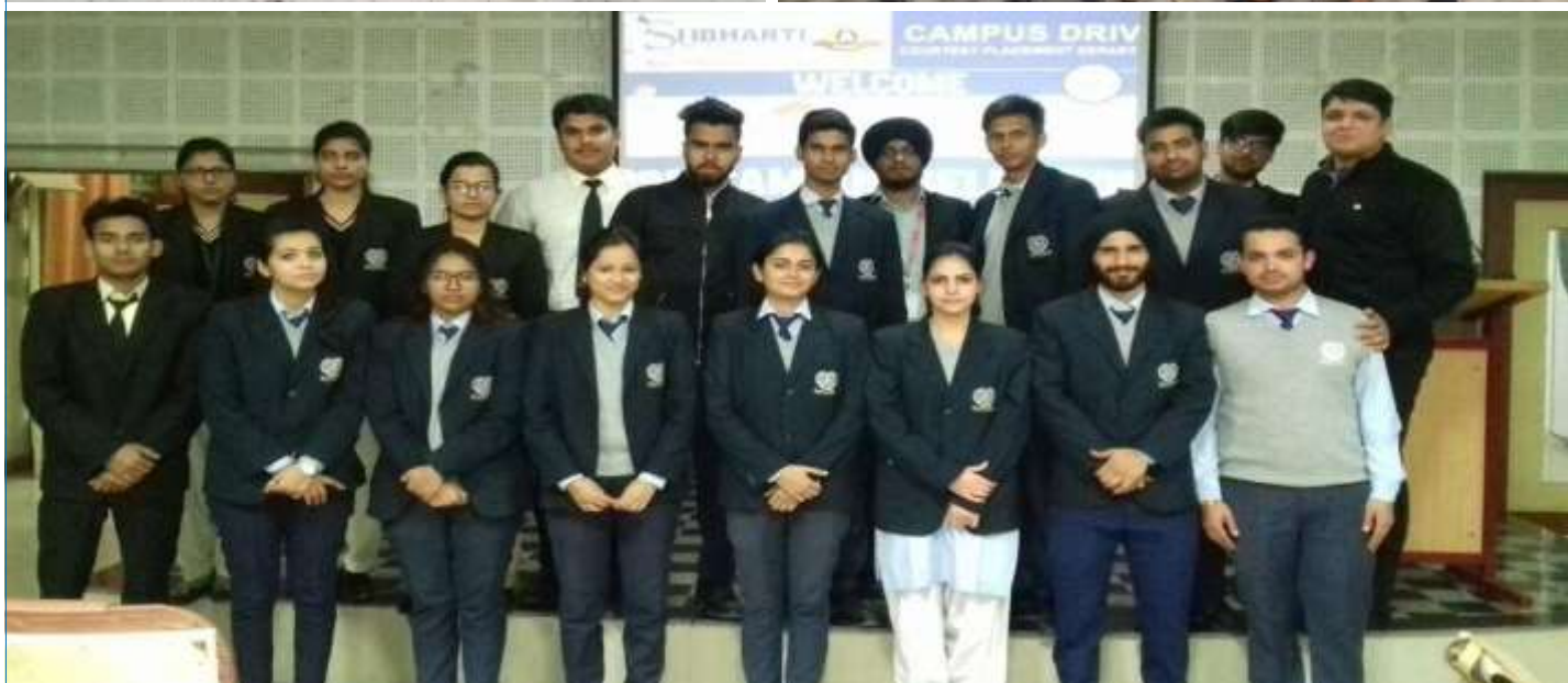
GLIMPSE OF THE ACTIVITIES OF TRAINING & PLACEMENT CELL